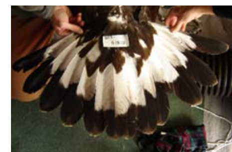
The tail feathers of a juvenile Golden Eagle displayed to their full glory.

We are a 501(c)3 non-profit organization. Your donations assure the continuation of our Research and Educational projects