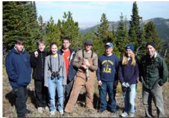
Members of Missoula Youth Homes

The high school programs consist of a series of days in the field, identifying and banding raptors. In the winter and spring this takes place in one of the nearby valleys where there is a known abundance of birds. In the fall, we invite students to join us on Rogers Pass to experience a scientific trapping station first hand. Our programs have been enjoyed by Willard School, a local alternative high school and Missoula Youth Homes: Radke House and Talbot House.