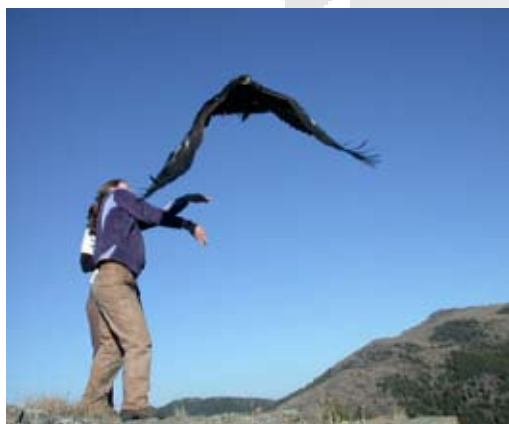
Free at Last! Releasing a Golden Eagle