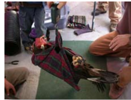
A Golden Eagle on the bird scale. Weight and other data are carefully collected in the banding tent before the raptors are released.